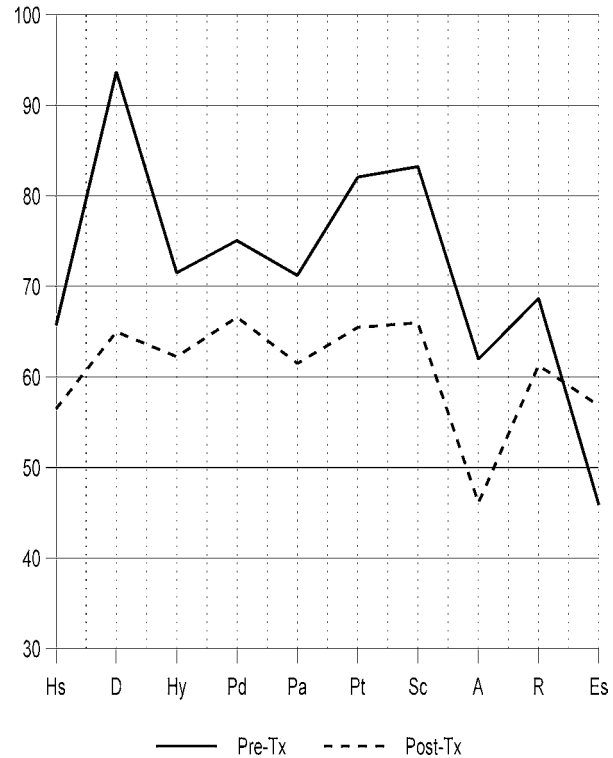
Fig. 3. Neurofeedback for depression: Average MMPI Pre-post changes for eight cases.

Pre-post changes on the MMPI may be seen in Fig. 3, with a mean decrease in the depression scale of 28.75 t -scores. One patient improved from severely depressed to normal and two progressed from being seriously depressed to normal. Three improved from severe to mild depression, and one improved from moderately depressed to mildly depressed. One case who was severely depressed only showed mild improvement. This was an individual who had lost his wife to cancer a year earlier and issues surrounding this loss seemed likely to need to be addressed, and he was referred for psychotherapy for these issues. Categorizing this last case and including the drop-out as failures, this represents 77.8% of cases who made significant improvements. The average length of follow-up for these cases was about 1 year, with a range from 2 years in two cases, to 4 months in the case of the individual who only mildly improved.